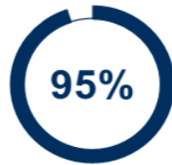
Year to Date (2019) The average daily attendance rate: Year-to-Date, derived from student attendance data sourced from the school systems as at 29/03/2019

We're really pleased with the number of parents/carers who have attended student interviews to share their perspectives of their child's strengths and areas for development, and strategies that we can all work together to enable all children to be successful.